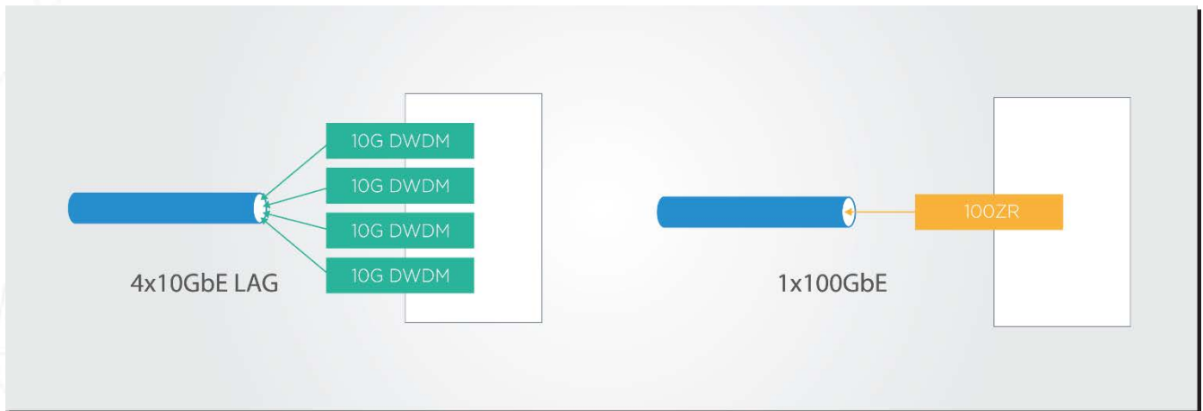
Figure 2: Comparison between 4x10G link aggregation and using a single coherent 100ZR link.

On the side of cable optical networks, the long-awaited migration to 10G Passive Optical Networks (10G PON) is happening and will also require the aggregation of multiple 10G links in optical line terminals (OLTs) and Converged Cable Access Platforms (CCAPs).