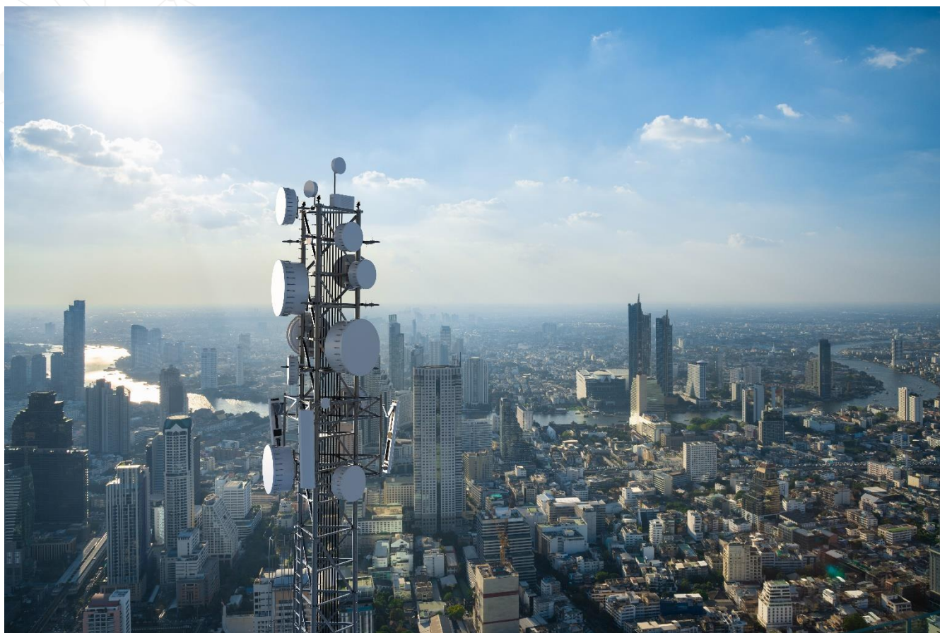
Figure 1: Telecommunication tower with 5G cellular network antenna on city background

One of the foremost challenges in smart cities and IoT networks is the sheer volume of data that needs to be processed and transmitted in real-time. Traditional electronic systems often struggle to keep up with this demand, leading to bottlenecks and inefficiencies. Photonics, on the other hand, utilizes light to transmit data, enabling significantly higher bandwidths and faster transmission speeds.