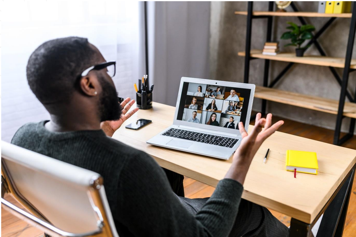
Figure 2: Optical networks have enabled a broader use of video calling worldwide.

The latency between data transmission and reception has long been a thorn for remote workers. Delays in video conferences, voice calls, and collaborative applications can hinder effective communication and teamwork. Optical networks come to the rescue with their remarkably low latency characteristics. The efficiency of transmitting data via light signals ensures that delays are minimized, enabling real-time interactions that simulate face-to-face communication.